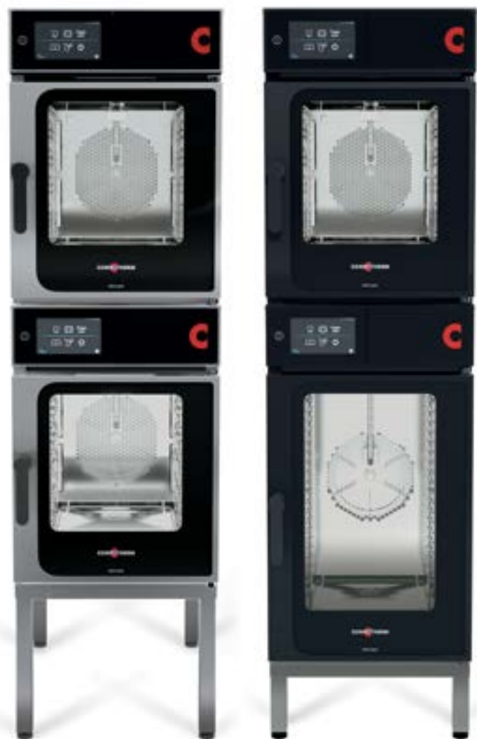
mini pro 6.10 + 6.10

The magic combination of convection heat and steam ensures food stays moist and fresh for longer. With Intelligent Steam Management, it optimises moisture levels to create exceptional menus while reducing water and energy consumption, and food waste.