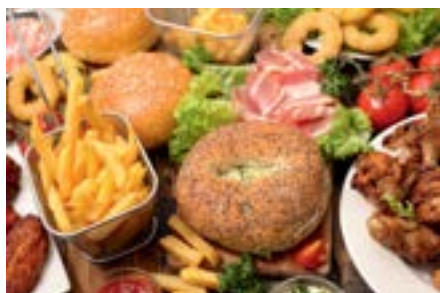
mini pro 6.10 + 10.10

Expand your menu offer thanks to the greater versatility of combi cooking