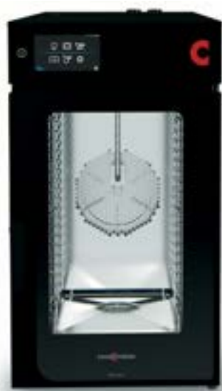
Available in silver or matte black