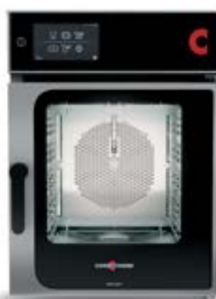
mini pro 6.10