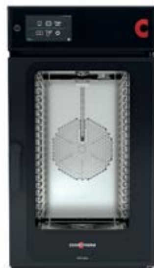
mini pro 10.10