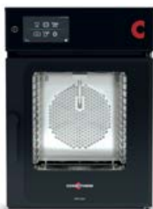
mini pro 6.06