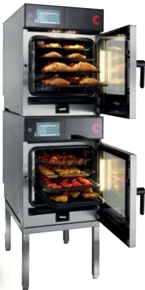
EasyStack – stack two ovens for double product output, same footprint