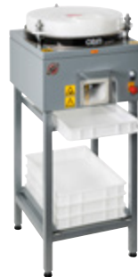
AST ON STAND