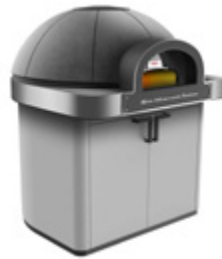
DOME + STAND