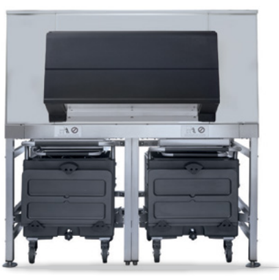
Dimensions: W 1748mm D 1267mm H 1803mm

Note: Ice production rate is measured with the water temperature at 10°C and an ambient temperature of 21°C.