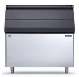
Dimensions: W 1235mm D 865mm H 1268mm