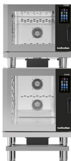
EC40T5 / EC40T7