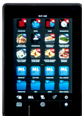
10" TOUCH CONTROL