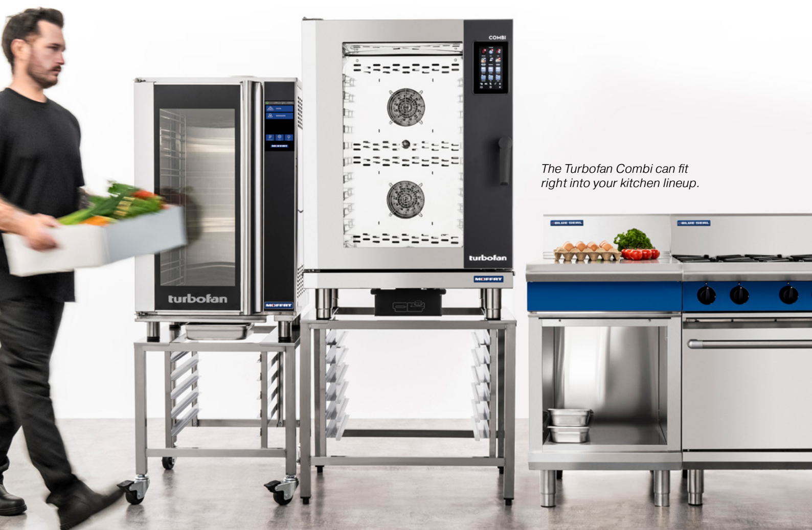
The Turbofan Combi can fit right into your kitchen lineup.

Turbofan's automatic cleaning system with selectable cycles reduces cleaning time and ensures the oven is sanitised and ready for next service.