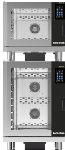
EC40T5 / EC40T10