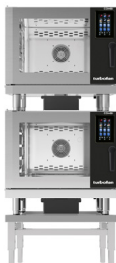
EC40T5 / EC40T5

No problem, the solution is to stack the following combinations.