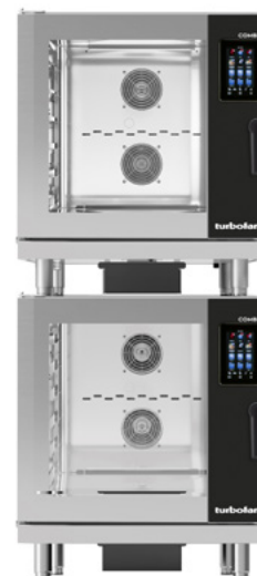
EC40T7 / EC40T7