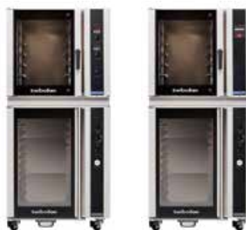
E35D6 on P85M12 Double Stacking Kit DSKE35P85