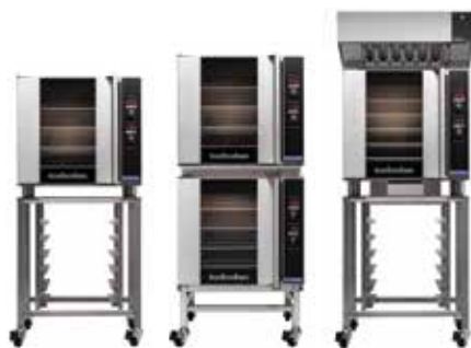
SK32 Oven Stand