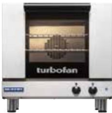
W 24" / 610mm H 23 7/8" / 607mm D 25 1/4" / 642mm