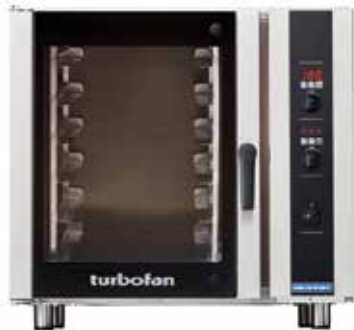
W 35 \frac{7}{8} " / 910mm H 34 \frac{5}{8} " / 880mm D 30 \frac{3}{8} " / 770mm