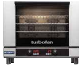
W 31 7/8" / 810mm H 26" / 662mm D 30" / 762mm