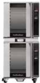
H8D-FS-UC Double Stacking Kit DSKH8FSUC/H10FS