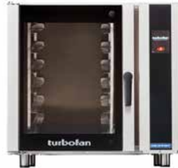
W 35 \frac{7}{8} " / 910mm H 34 \frac{5}{8} " / 880mm D 30 \frac{3}{8} " / 770mm