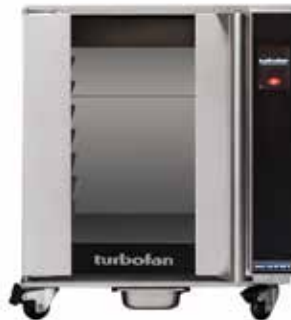
W 28 7/8" / 735mm H 31 7/8" / 810mm D 31 7/8" / 810mm