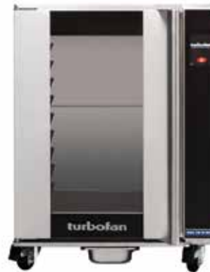
W 28 7 / 8 " / 735mm H 40" / 1015mm D 31 1 / 8 " / 810mm