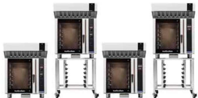
VH35-26 on E35D6-26 VH35-26 on E35D6-26 on SK35 VH35-26 on E35T6-26 VH35-26 on E35T6-26 on SK35