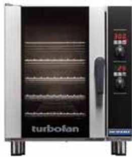
W 24" / 610mm H 28 3/4" / 730mm D 26 3/4" / 680mm