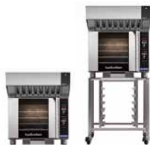
VH31 on E31D