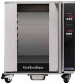
W 28 7/8" / 735mm H 31 7/8" / 810mm D 31 7/8" / 810mm