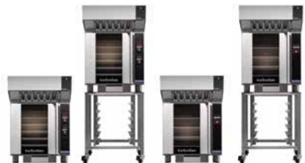
VH32 on E32D5