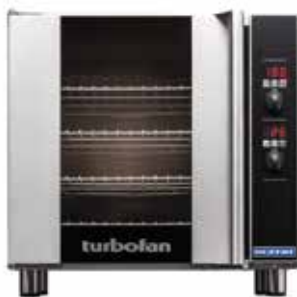
W 28 3 / 8 " / 735mm H 28 3 / 4 " / 730mm D 31 1 / 8 " / 810mm