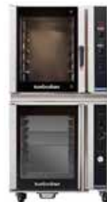
E35D6 on P85M8 Double Stacking Kit DSKE35P85