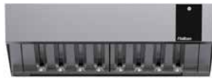
W 38 \frac{1}{8} " / 918mm H 14 \frac{3}{8} " / 364mm D 41" / 1042mm