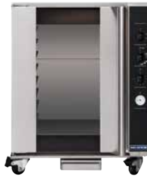
W 28 7 / 8 " / 735mm H 36" / 914mm D 31 7 / 8 " / 810mm