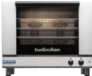
W 31 7/8" / 810mm H 26" / 662mm D 30" / 762mm