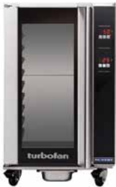
W 24" / 610mm H 40" / 1015mm D 26 3/4" / 680mm