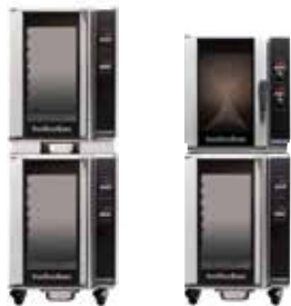
H8D-UC Double Stacking Kit DSKH8UC/H10 E33D5 on H8D-UC Double Stacking Kit DSKE33P10