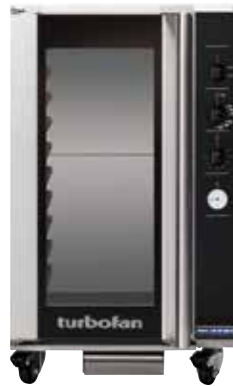
W 24" / 610mm H 40" / 1015mm D 26 3 / 4 " / 680mm