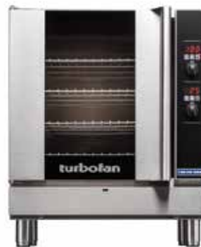
W 28⅞" / 735mm H 35⅞" / 910mm D 31⅞" / 810mm