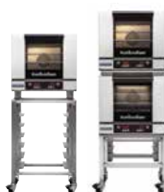
SK23 Oven Stand E23D3 Double Stacking Kit DSK2223 - adjustable feet DSK2223C - casters