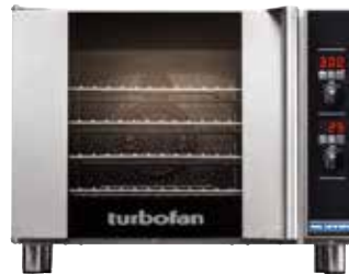
W 31 7/8" / 810mm H 24 5/8" / 625mm D 24 1/4" / 616mm