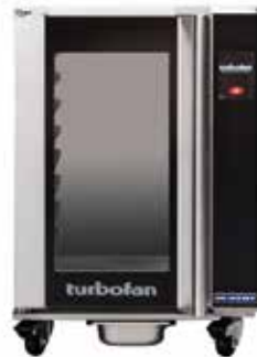
W 24" / 610mm H 31 7/8" / 810mm D 26 3/4" / 680mm