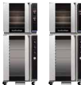
E32D5 on P12M Double Stacking Kit DSKE32P12