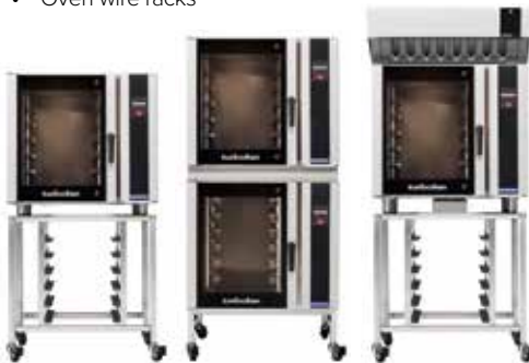
SK35 Oven Stand