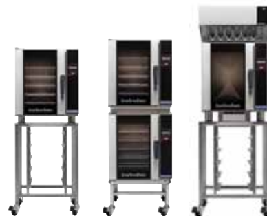
SK33 Oven Stand