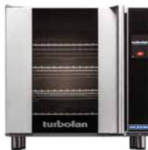
W 28 3 / 8 " / 735mm H 28 3 / 4 " / 730mm D 31 1 / 8 " / 810mm