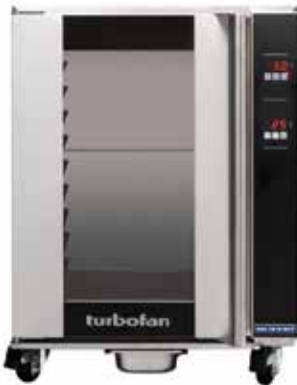
W 28 7 / 8 " / 735mm H 40" / 1015mm D 31 1 / 8 " / 810mm