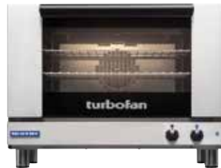
W 31 1/8" / 810mm H 23 3/8" / 607mm D 30" / 762mm