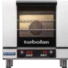
W 24" / 610mm H 23 7/8" / 607mm D 25 1/4" / 642mm