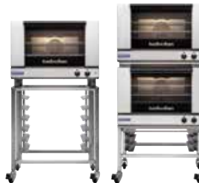
SK2731U Oven Stand