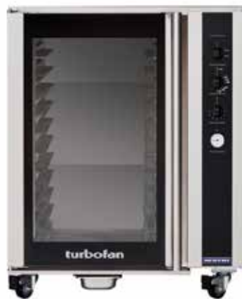
W 35 \frac{7}{8} " / 910mm H 44 \frac{1}{2} " / 1129mm D 34 \frac{5}{8} " / 810mm