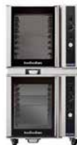
P85M8 Double Stacking Kit DSKP85