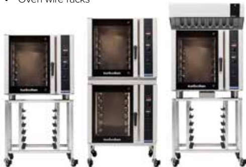
SK35 Oven Stand