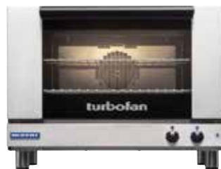
W 31⅞" / 810mm H 23⅞" / 607mm D 30" / 762mm