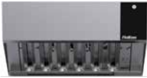
W 24 \frac{3}{8} " / 618mm H 14 \frac{1}{2} " / 367mm D 35" / 889mm