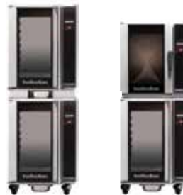
H8T-UC Double Stacking Kit DSKH8UC/H10 E33T5 on H8T-UC Double Stacking Kit DSKE33P10