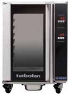
W 24" / 610mm H 31 7/8" / 810mm D 26 3/4" / 680mm