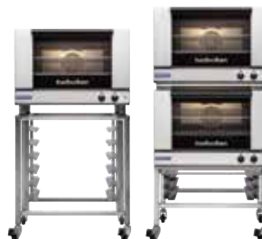
SK2731U Oven Stand