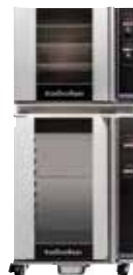
E32T5 on H10T-FS Double Stacking Kit DSKE32P8