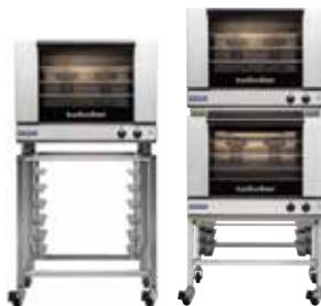
SK2731U Oven Stand