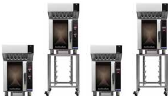
VH33 on E33D5 VH33 on E33D5 on SK33VH VH33 on E33T5 VH33 on E33T5 on SK33VH