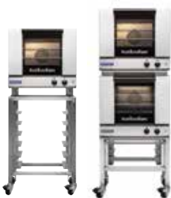
SK23 Oven Stand E23M3 Double Stacking Kit DSK2223 - adjustable feet DSK2223C - casters