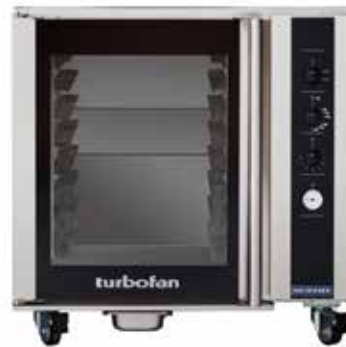
W 35 \frac{7}{8} " / 910mm H 36" / 914mm D 34 \frac{5}{8} " / 880mm