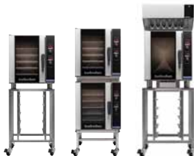
SK33 Oven Stand