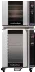
E32D5 on H10D-FS Double Stacking Kit DSKE32P8