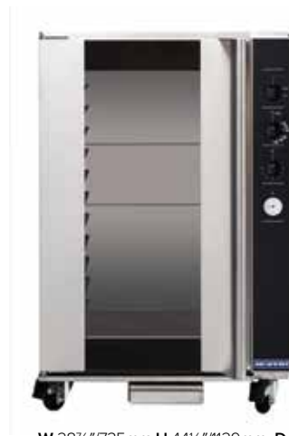
W 28 7 / 8 " / 735mm H 44 1 / 2 " / 1129mm D 31 7 / 8 " / 810mm