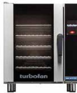
W 24" / 610mm H 28 3/4" / 730mm D 26 3/4" / 680mm