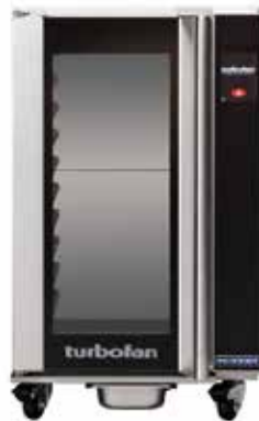
W 24" / 610mm H 40" / 1015mm D 26 3/4" / 680mm