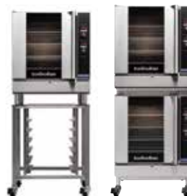
SK32 Oven Stand