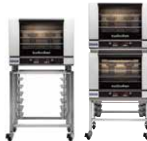
SK2731U Oven Stand