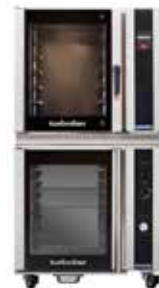
E35T6 on P85M8 Double Stacking Kit DSKE35P85