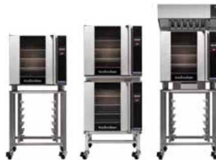
SK32 Oven Stand