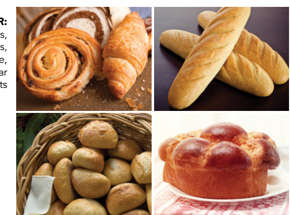
IDEAL FOR: French bread, sub rolls, dinner rolls, baguettes, croissants, brioche, cinnamon buns, par bake products

Humidity control. With the assurance of humidity control within the proofing chamber optimum results can be obtained quickly and easily.