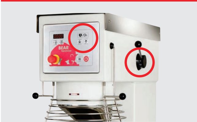
VL-1L – Manual speed regulation and automatic bowl lowering