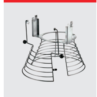
Removable safety guard in stainless steel. Not CE-certified