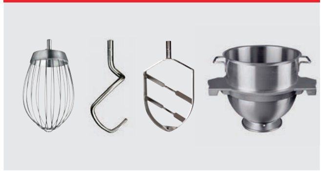
Whip, hook, beater and bowl 100/60 liter in stainless steel and Whip, hook, beater and bowl 100/40 liter in stainless steel.