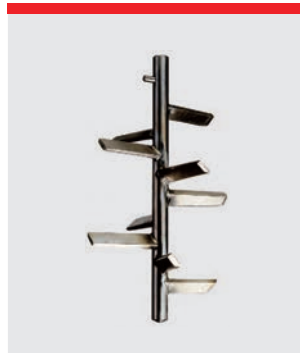
Powder mixer, stainless steel