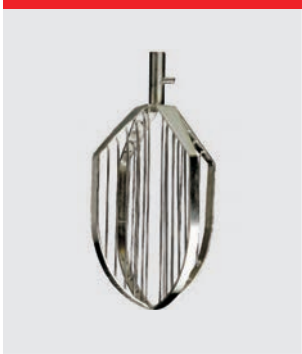
Wing whip, stainless steel