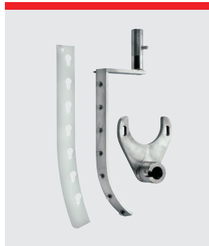
Automatic scraper, stainless steel. Nylon or teflon blade. 100L, 100/60l, and 100/40L.