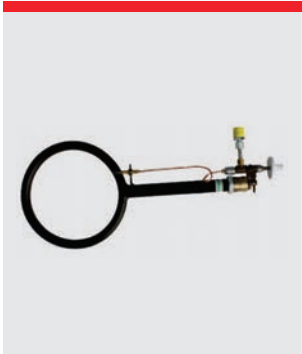
Ring gas burner. Natural or liquid gas.