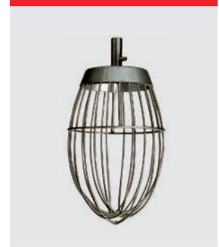
Whip with reinforcement