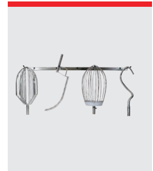
Tool rack, 127 cm