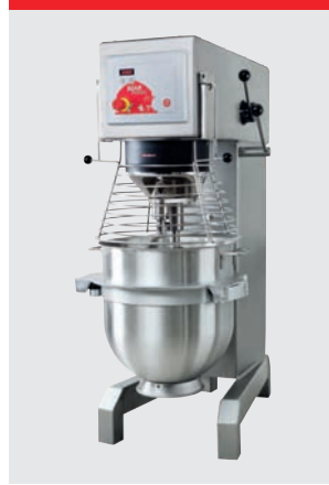
Marine version, stainless steel