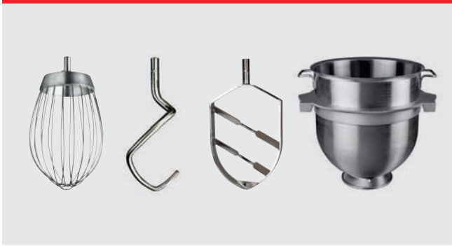
Whip, hook, beater and bowl 100 liter in stainless steel.