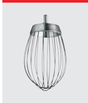
Whip with thinner wires, stainless steel