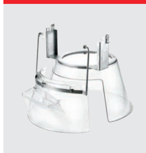
Removable safety guard in plastic. CE-certified