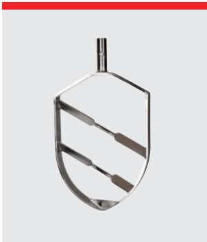
Beater, stainless steel