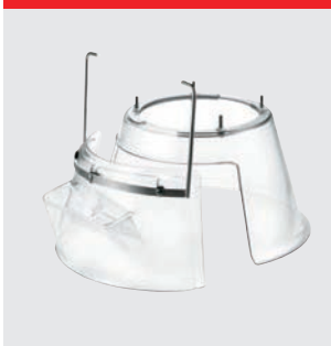
Fixed safety guard in plastic. CE-certified