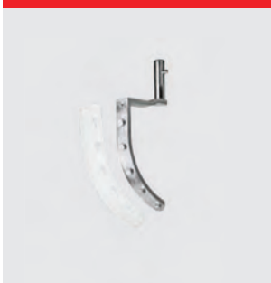
Automatic scraper in stainless steel. Nylon or teflon blade. 20L and 20/12L.