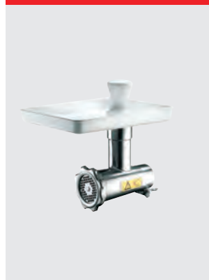
Meat mincer, 70 mm