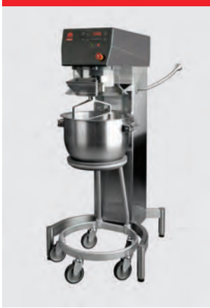
Stainless steel, 20 L floor