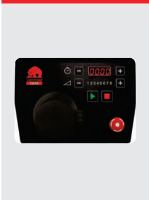
Attachment drive for meat mincer and vegetable cutter