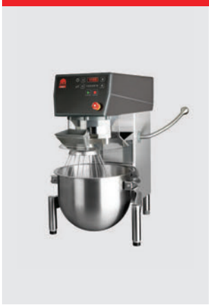
Stainless steel, 20 L table model