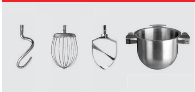
Hook, whip, beater and bowl 20/12 L in stainless steel.