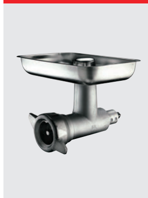
Meat mincer, 82 mm