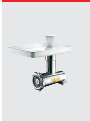
Meat mincer, 70 mm