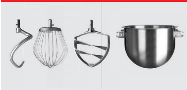
Hook, whip, beater and bowl 20 L in stainless steel.