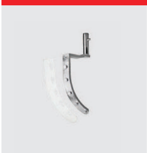
Automatic scraper in stainless steel. Nylon or teflon blade. 20L and 20/12L.