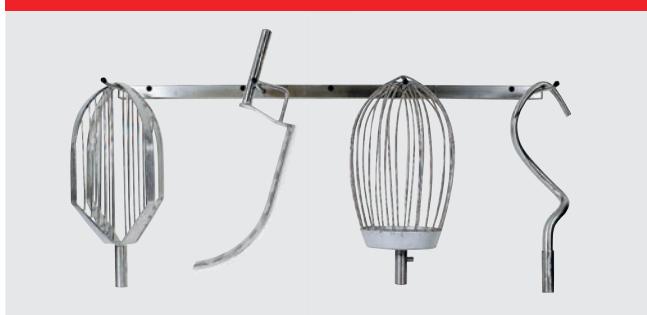
Tool rack, 91 cm