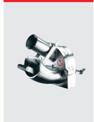
Vegetable cutter GR20