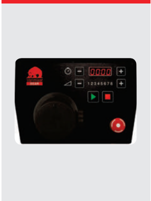
Attachment drive for meat mincer and vegetable cutter