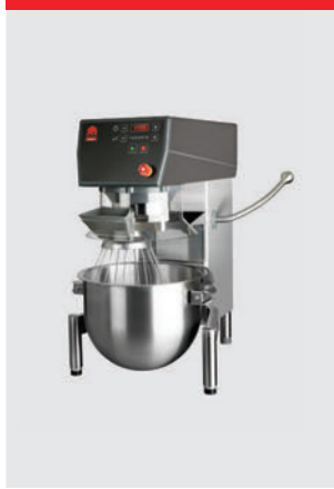
Marine version, 20 L table model