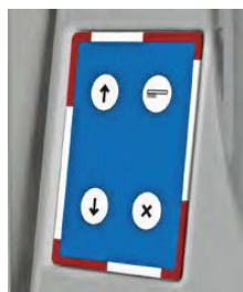
R20T2 Control Panel