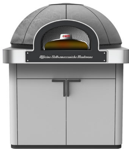
DOME TOUCH on OMSU571