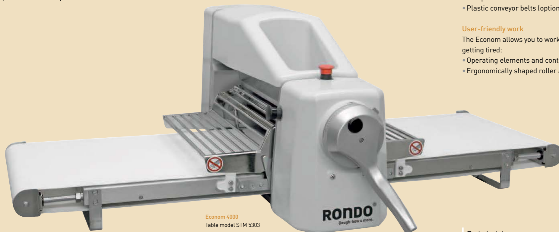
Econom 4000 Table model STM 5303

The Econom sheets dough gently and precisely and only uses a minimum of space. With its 500 mm working width, it is the ideal dough sheeter for narrow areas, for example in hotels, restaurants, pizza shops, canteen kitchens, and artisanal bakeries and confectioners.