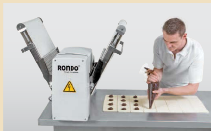
When not in use, the tables are simply folded up and you gain valuable working space.