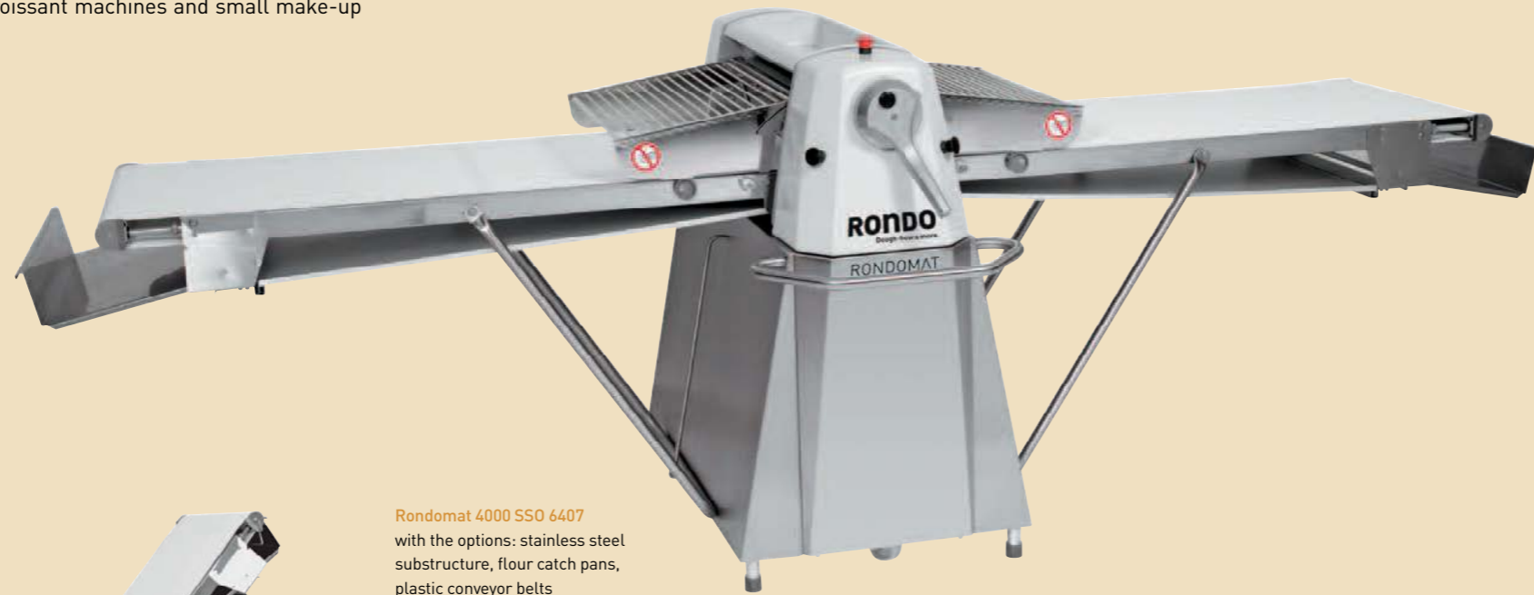
Rondomat 4000 SSO 6407 with the options: stainless steel substructure, flour catch pans, plastic conveyor belts

The Rondomat is the right dough sheeter for small to medium-sized bakeries. It features a rugged and ergonomic design. With the Rondomat, you process all types of dough gently to form consistent blocks and bands of dough. The working width of 650 mm even allows you to feed cutting tables, croissant machines and small make-up lines.