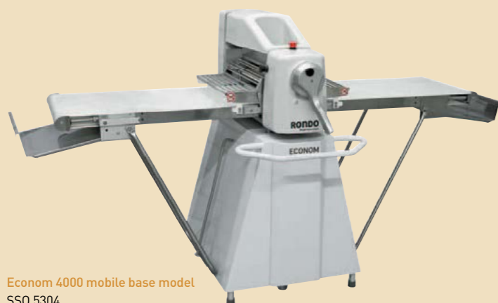
Econom 4000 mobile base model SSO 5304