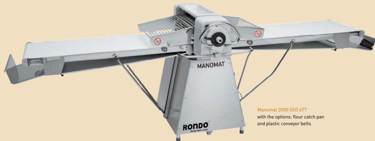
Manomat 2000 SSO 677 with the options: flour catch pan and plastic conveyor belts

With the Manomat and Automat, you quickly process particularly large quantities of dough. You can also work effortlessly in multiple shifts. Numerous elaborate details ensure maximum operator convenience. The design is extremely rugged and smooth surfaces made of stainless steel make cleaning simple.