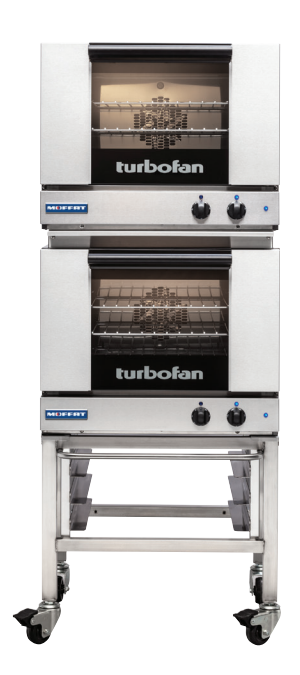
Model E22M3/2C shown

Half Size Manual / Electric Convection Ovens Double Stacked on a Stainless Steel Base Stand