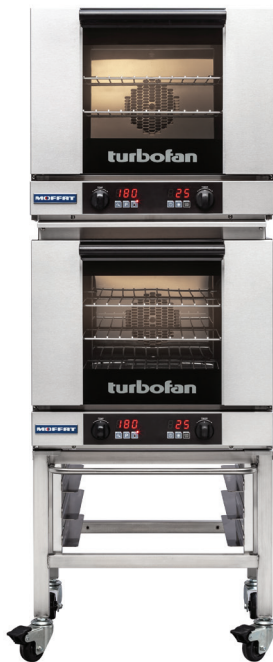
Model E23D3/2C shown

Half Size Digital / Electric Convection Ovens Double Stacked on a Stainless Steel Base Stand