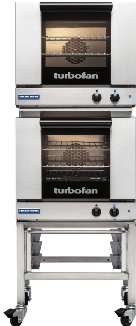
Model E23M3/2C shown

Double Stacked on a Stainless Steel Base Stand