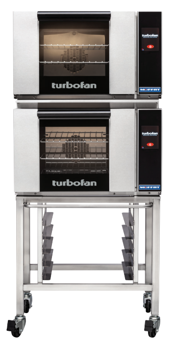
Model E23T3/2C shown

Half Size Electric Convection Ovens TOUCH SCREEN CONTROL Double Stacked on a Stainless Steel Base Stand