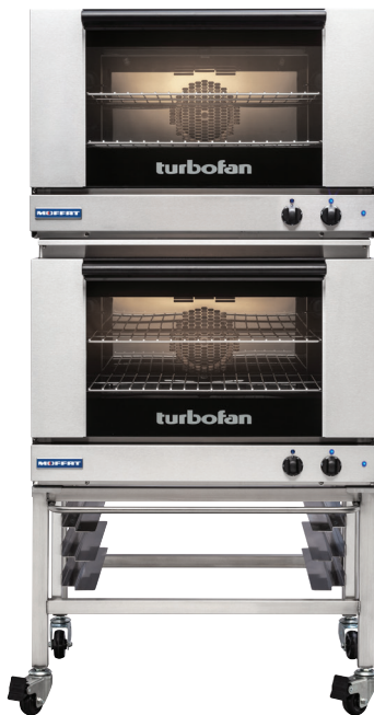
Model E27M2/2C shown

Double Stacked on a Stainless Steel Base Stand