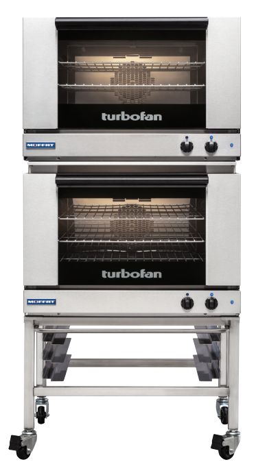
Model E27M3/2C shown

Full Size Manual / Electric Convection Ovens Double Stacked on a Stainless Steel Base Stand