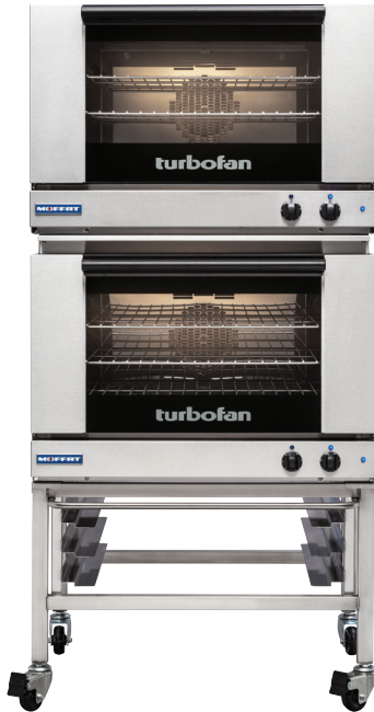
Model E27M3/2C shown

Double Stacked on a Stainless Steel Base Stand