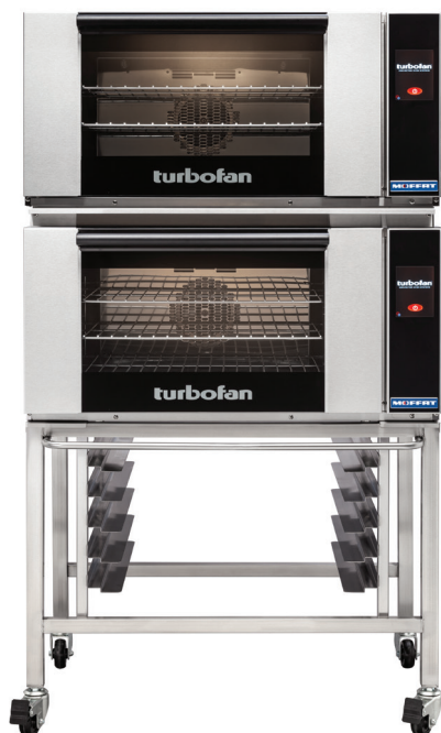
Model E27T3/2C shown

Double Stacked on a Stainless Steel Base Stand