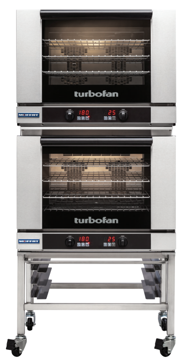
Model E28D4/2C shown

Full Size Digital / Electric Convection Ovens Double Stacked on a Stainless Steel Base Stand