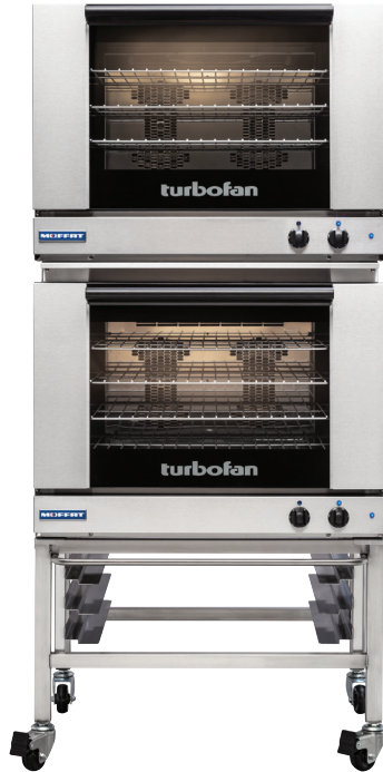
Model E28M4/2C shown

Double Stacked on a Stainless Steel Base Stand