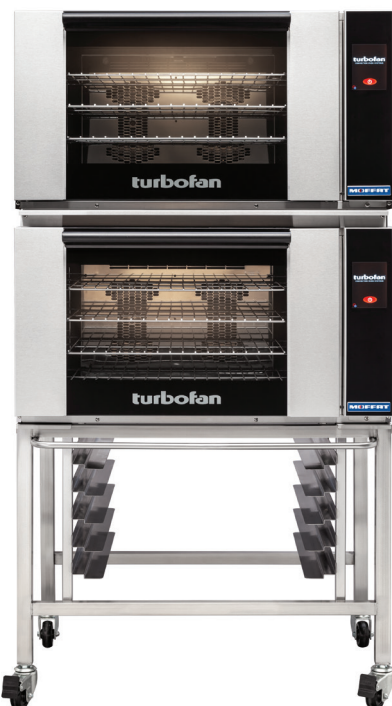
Model E28T4/2C shown

Double Stacked on a Stainless Steel Base Stand