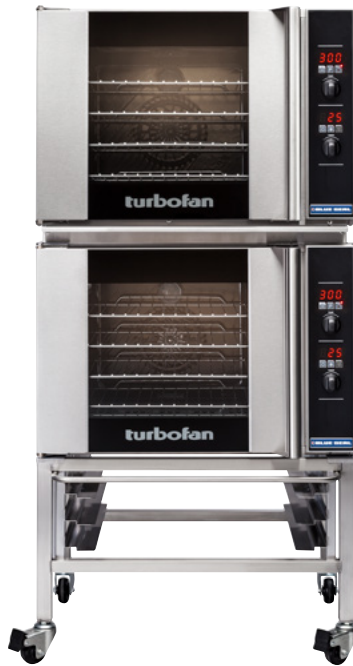
Model E31D4/2C shown

Double Stacked on a Stainless Steel Base Stand