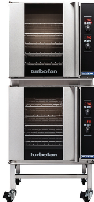
Model E32D5/2C shown