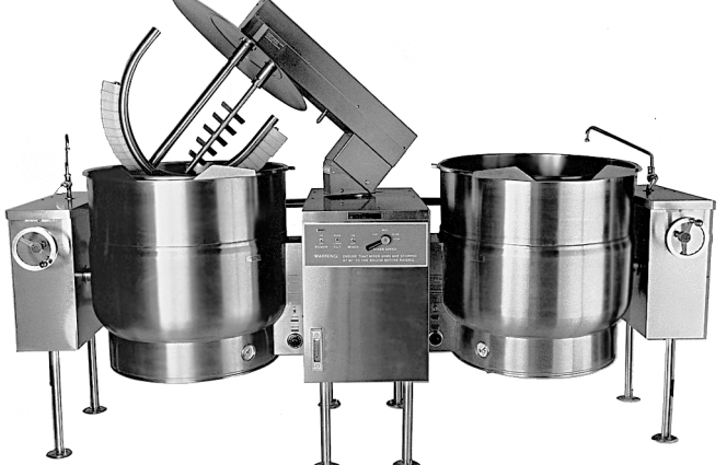
Not exactly as shown