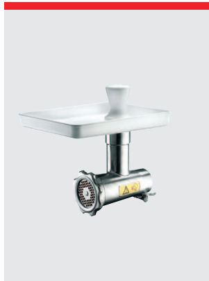
Meat mincer, 70 mm