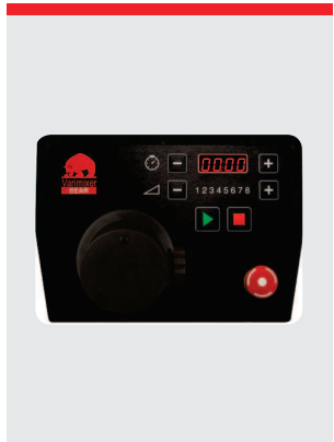
Attachment drive for meat mincer and vegetable cutter