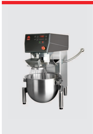
Stainless steel, 20 L table model