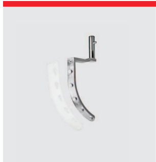
Automatic scraper in stainless steel. Nylon or teflon blade. 20L and 20/12L.