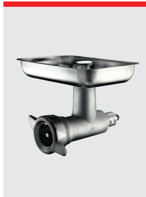
Meat mincer, 82 mm