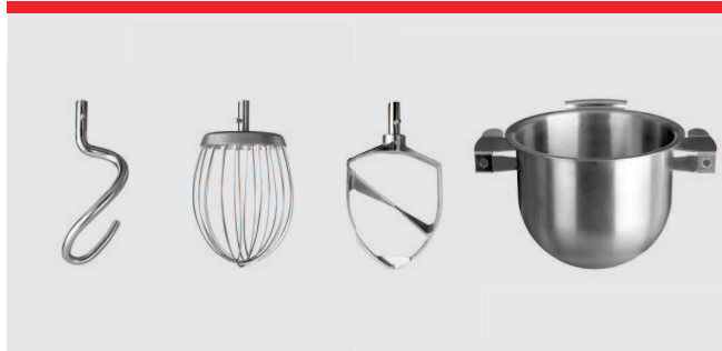
Hook, whip, beater and bowl 20/12 L in stainless steel.