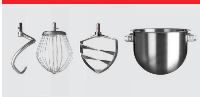
Hook, whip, beater and bowl 20 L in stainless steel.