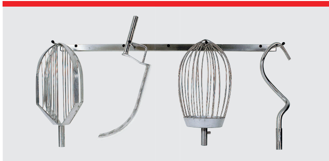
Tool rack, 91 cm