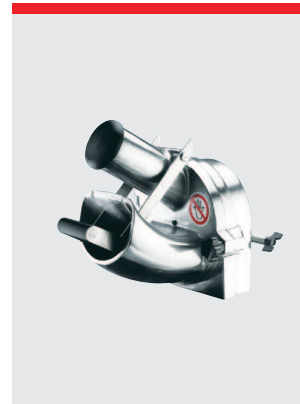
Vegetable cutter GR20