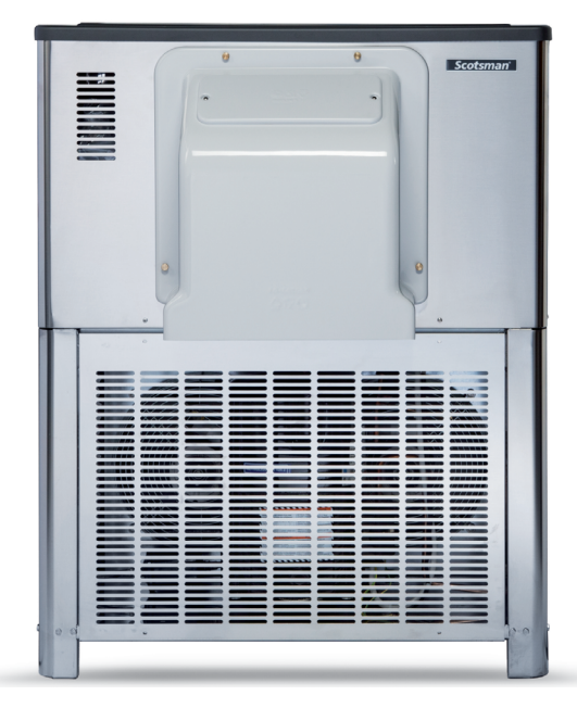
Scale ice - 1-2mm, residual water content 2%

MAR 76 AS Scale Ice thickness — 1-2mm, residual water content 2%