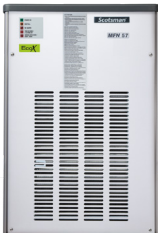
Nugget ice 1g – Ø 11mm x H 13mm