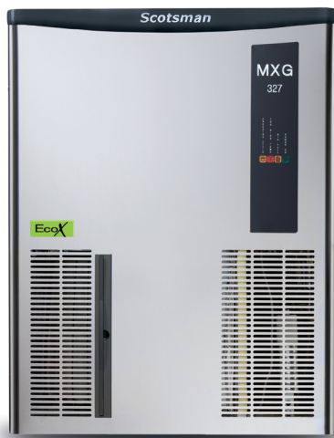
Medium gourmet cube 20g, 30mm dia x H 34mm