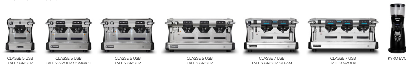
CLASSE 5 USB TALL 1 GROUP