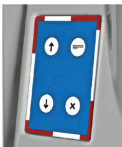
R20T2 Control Panel