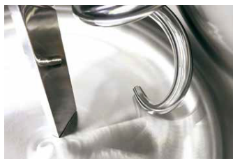
Straight Breaking Column