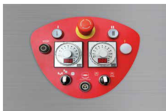
Standard Analogue Control Panel