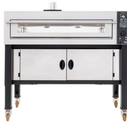
SUPERTO TOUCH635S on OMSU503