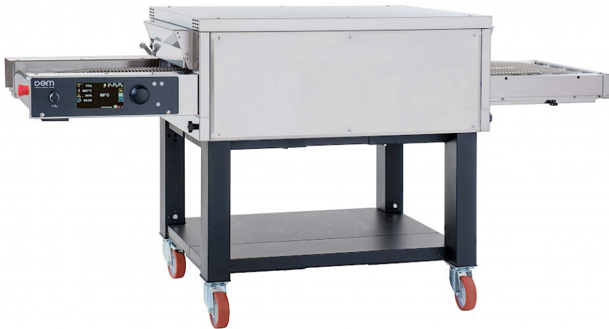
TUNNEL TL105LCD on OMSU531