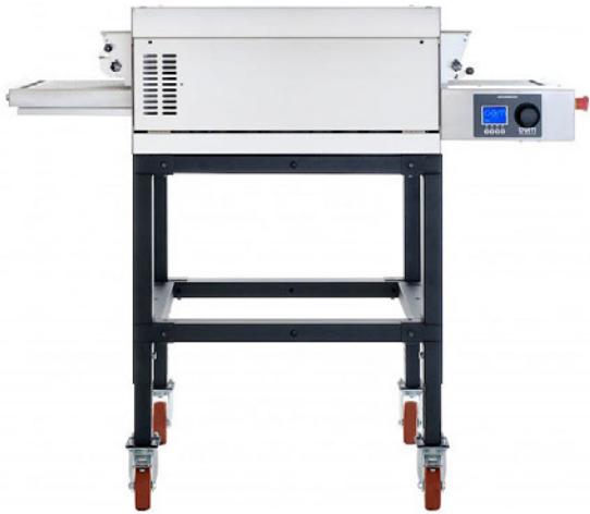
TUNNEL TL45TOUCH on OMSU538