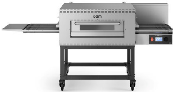
TUNNEL TLV80 on OMSU580